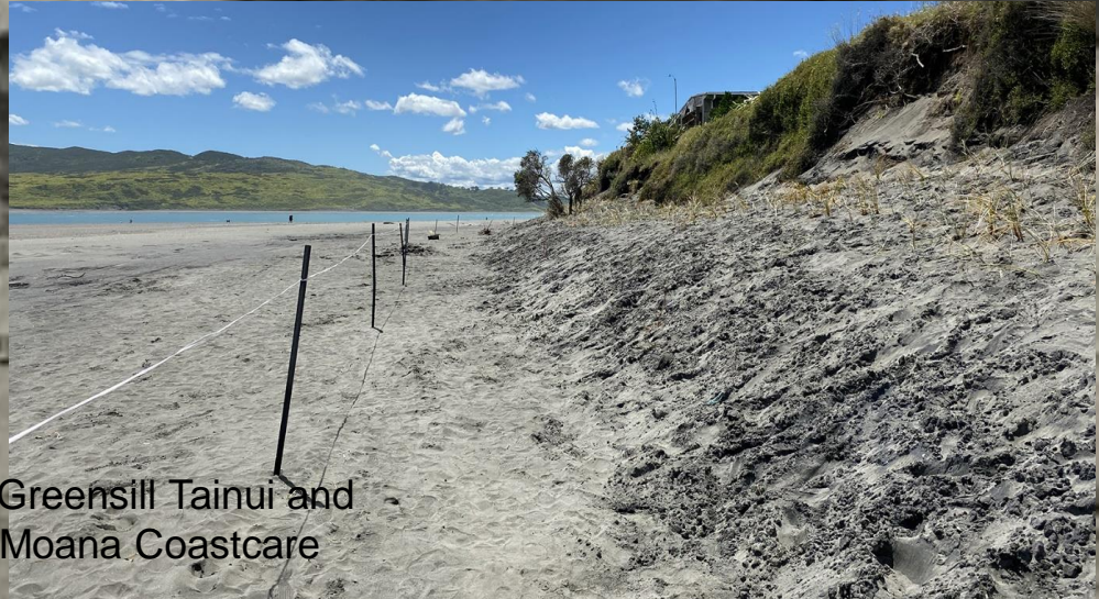
March 2024 A. Greensill Tainui and Whaingaroa Moana Coastcare