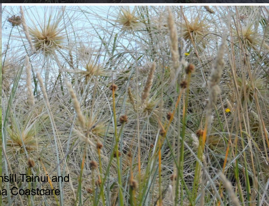
March 2024 A. Greensill Tainui and Whaingaroa Moana Coastcare