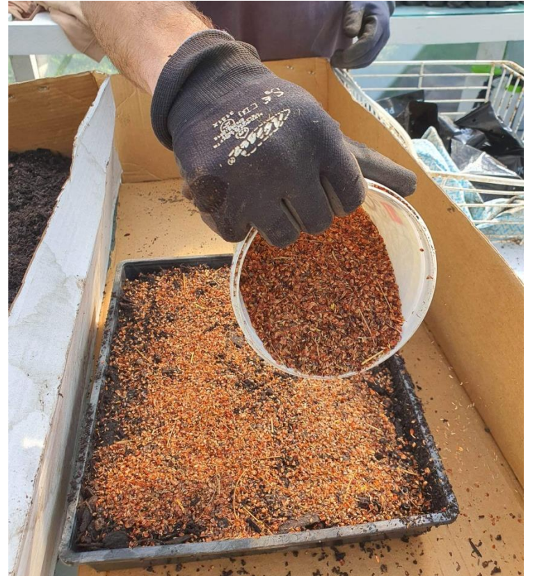
Pingao propagating in my nursery funded by Te Puni Kokari