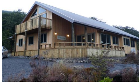
F&B Lodge – Mt Ruapehu